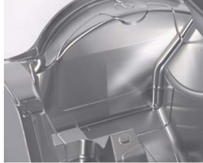
Surface finishes obtained by using FF/CAM can drastically reduce, and in many cases eliminate costly bench work.

Makino is a company of many dimensions Makino is really many companies in one: A world leader in metal cutting and manufacturing technology. A manufacturer of machining centers, wire EDM and ram EDM machines. A software company and an application engineering company. A service company and a financing company. A turnkey engineering company and an integration services company. An automation company and a machine tool supplies company. A training company and a process technology company.