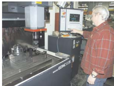
On-site training and support are provided by professionals who understand your business.